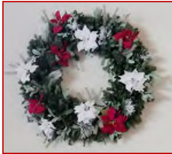
The November Social was focused on decorating for Advent plus enjoying Chili and one of the many Soups!